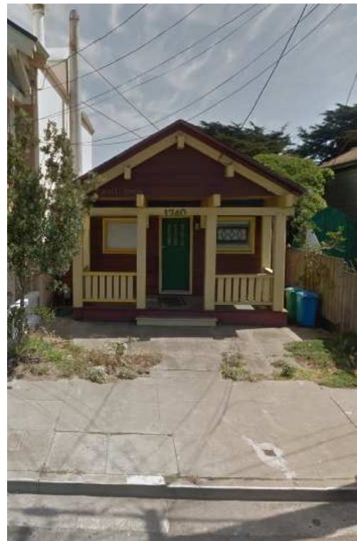
Image of an historic building with high integrity, as identified by an historic preservation survey of the Oceanside neighborhood, funded in part by the HPFC.