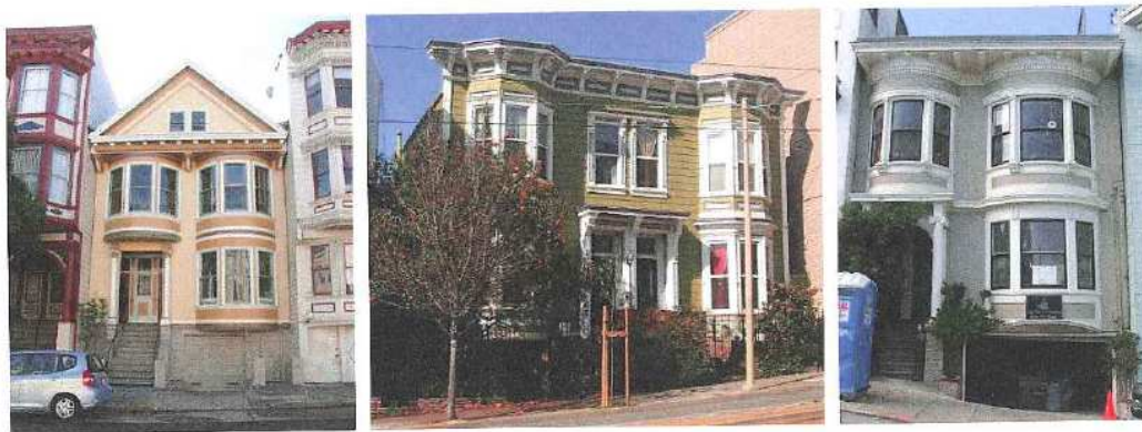
Image taken from Mission Dolores Neighborhood Survey, which was funded by the HPFC.

It is recommended that organizations that are not yet City-approved vendors begin the certification process as soon as possible, in order to ensure that they are able to meet this requirement if awarded a grant. The City's Office of Contract Administration offers all of the necessary forms on its website, which can be found at: http://www.sfgov.org/site/oca_page.asp?id=26550 . Subcontractors are not required to be City-approved vendors.