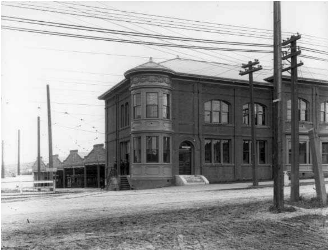
Image of the Geneva Office Building, whose nomination to the National Register of Historic Places was funded by the HPFC.

When considering large requests, the HPFC may recommend funding be approved in phases.